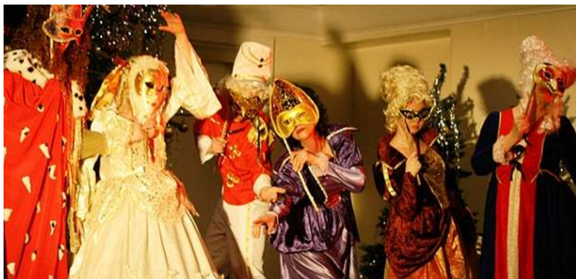
Russian Theatre School in London