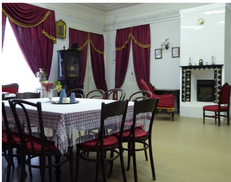
Ready for a tea party in the Cherdyn museum